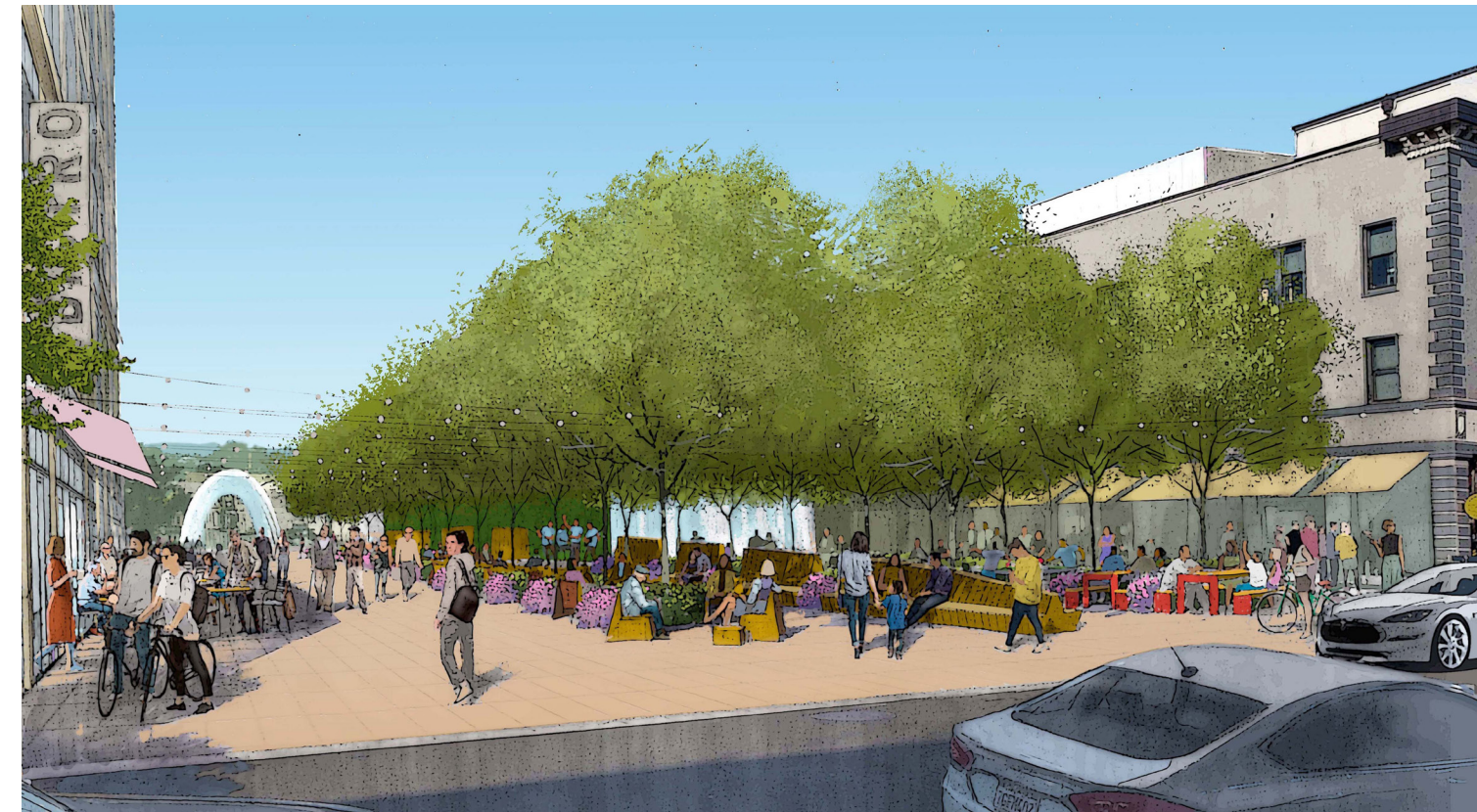
Proposed Town Square - View from Lorton Avenue

Farmers' Market. The Town Square will also have a water feature, public art, a small stage, public rest rooms, and a combined trash enclosure for the buildings along Burlingame Avenue. The Town Square is framed by a new office building with ground floor shops and restaurants. The edges along the Town Square are designed to accommodate outdoor dining and seating. The Town Square complements the vibrant downtown Burlingame Avenue and provides a new place to meet, relax, eat, drink, and enjoy events.