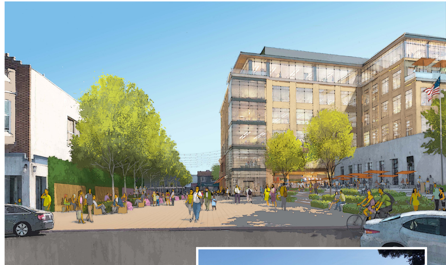
Proposed Town Square - View from Park Road