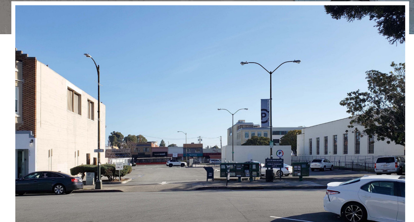
View from Park Road today