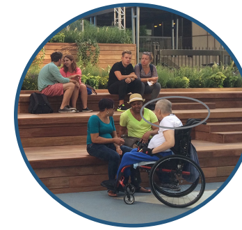
Terrace at Post Office