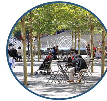
Grove of Trees